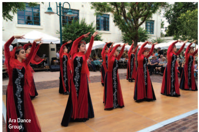
Ara Dance Group