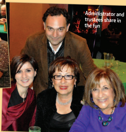
Administrator and trustees share in the fun