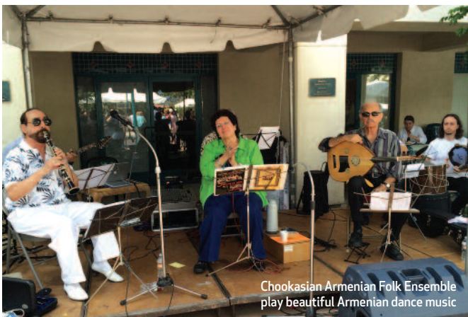
Chookasian Armenian Folk Ensemble play beautiful Armenian dance music