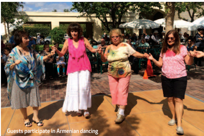
Guests participate in Armenian dancing