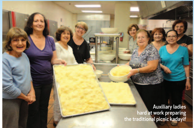
Auxiliary ladies hard at work preparing the traditional picnic kadayif