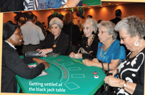
Getting settled at the black jack table