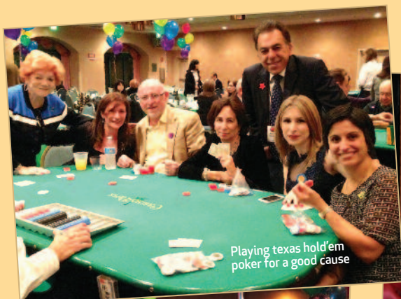
Playing texas hold'em poker for a good cause