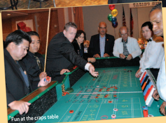
Fun at the craps table