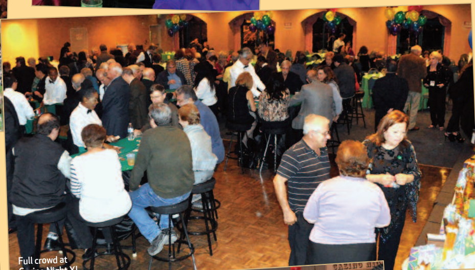
Full crowd at Casino Night XI