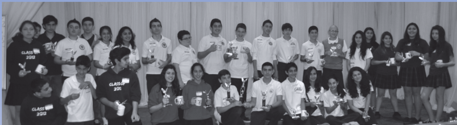
Quiz Bowl participants make new friends, take home trophies and cash prizes for their schools.

After months of study and preparation, eighth grade students from eight local Armenian day schools competed enthusiastically in the 13th Annual Ararat Home Quiz Bowl on Sunday, April 29, 2012, in the Mission Hills Deukmejian Ballroom with awards going toward the scholarship funds of each of the schools. The first place award of $1,000 was bestowed on the Rose and Alex Pilibos Armenian School, second place award of $750 presented to Holy Martyrs Ferrahian Armenian School, and third place award of $500 given to the St. Gregory (Hovsepien) Armenian School.