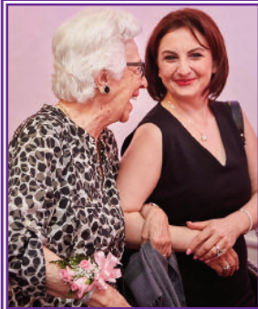
▲ Residents escorted into the ballroom by staff members